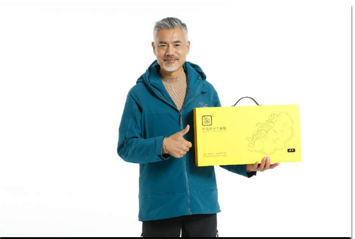
High-end, hand-made gift box