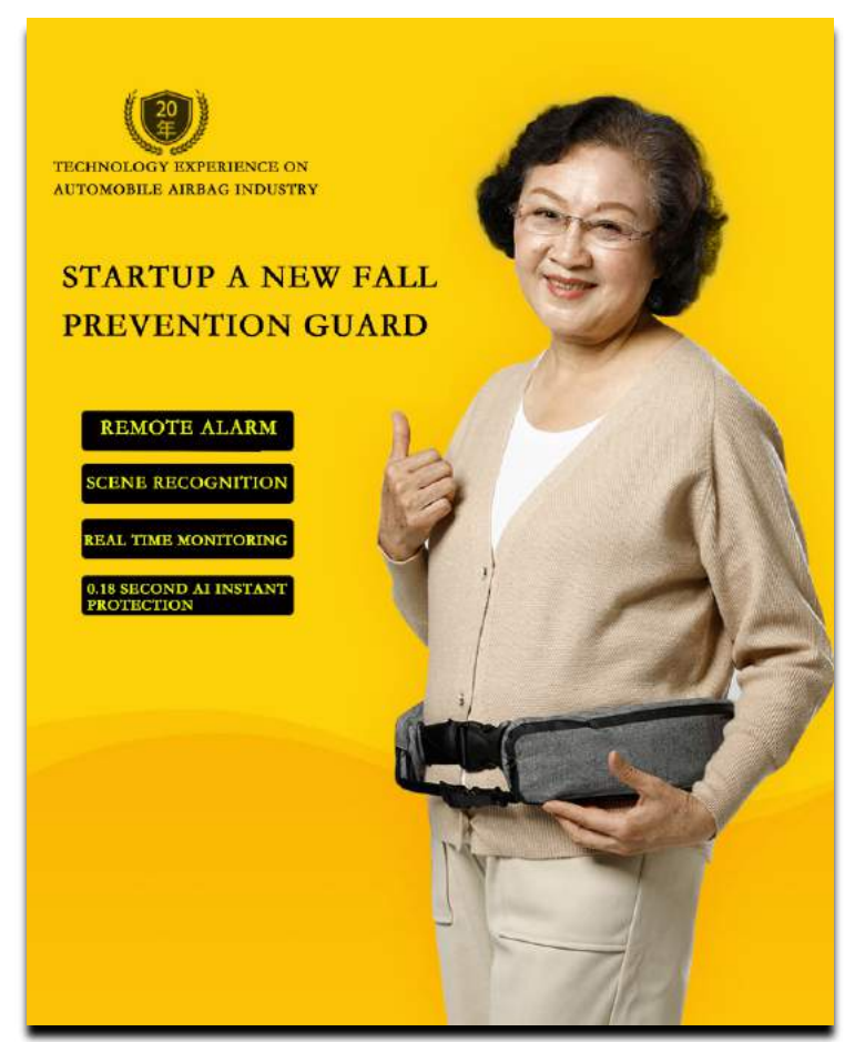
Daily wear diagram

There are 8 to 10 independent safety air camber, tight structure and solid ring shape and unique safety buckle tech could make airbag fit for hips and legs seamlessly, no deformation and dislocation, provide close care at the moment of falling.