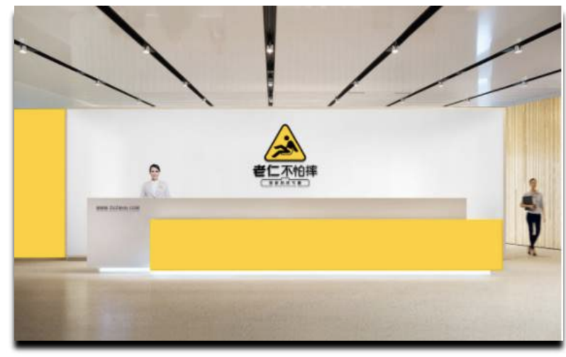
Smart airbag on the body / No worry about Slipping